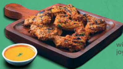
wings of joy