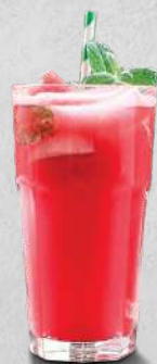
watermelon fresh fruit mojito