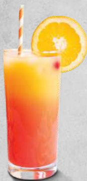
sun rise mocktail