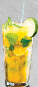
pineapple chilly mojito