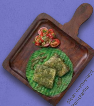
Meen Vazhayilayil Pollichathu