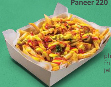
philly fries with jalapenos