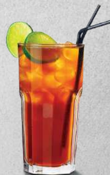
iced lemon tea