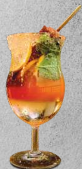
ice candy mojito